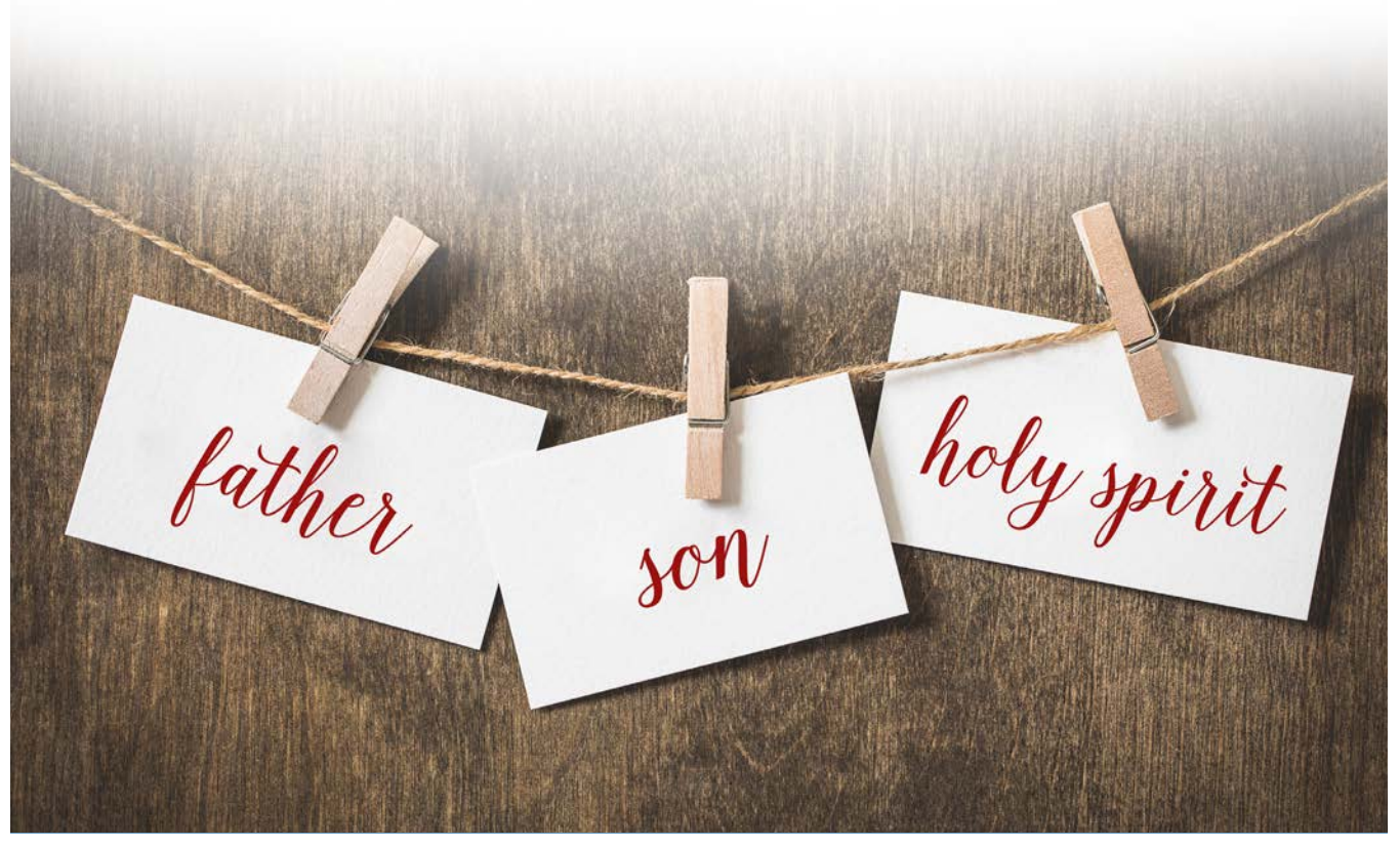
MARRIAGE, LIFE AND FAMILY: REFLECTING THE HOLY TRINITY

Christian theology, on the contrary, renounces every effort to isolate and individualize the human being with the same unyielding determination as it refuses to divide the Holy Trinity, recognizing the inherent relationships of human existence as God-given and fundamental to human identity.